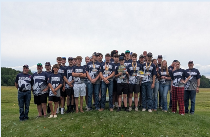
Coaches and Team

What an amazing accomplishment for this group of athletes. Their hard work, dedication and teamwork paid off in a big way. Congratulations to all of the shooters, coaches and families who helped make this championship season one to remember!