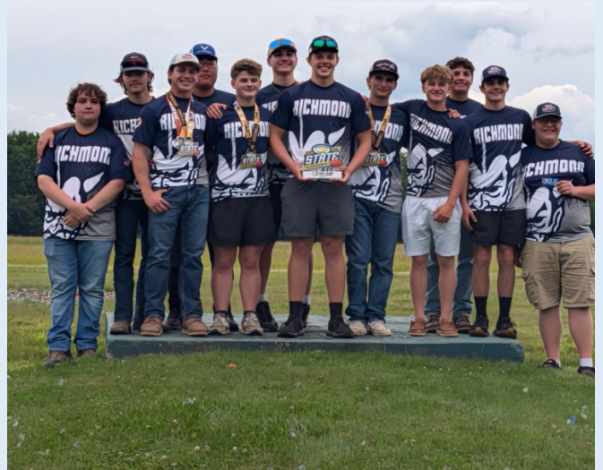
Senior Class of 2026