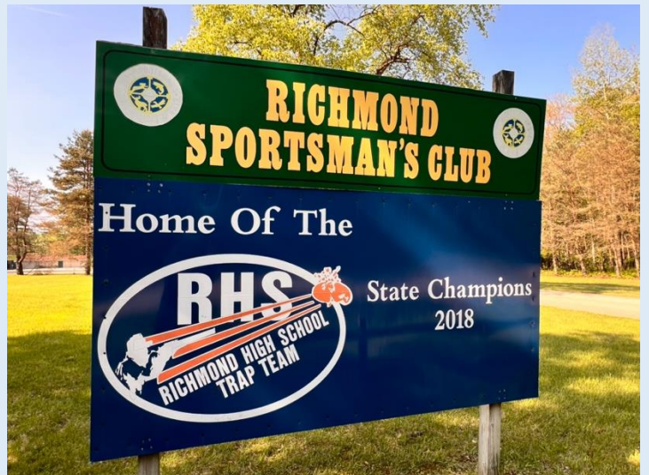
So Proud of Our Club