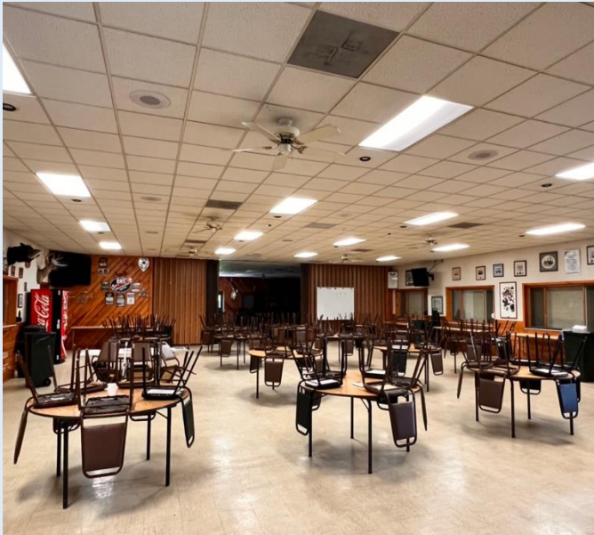
Clean Up Day