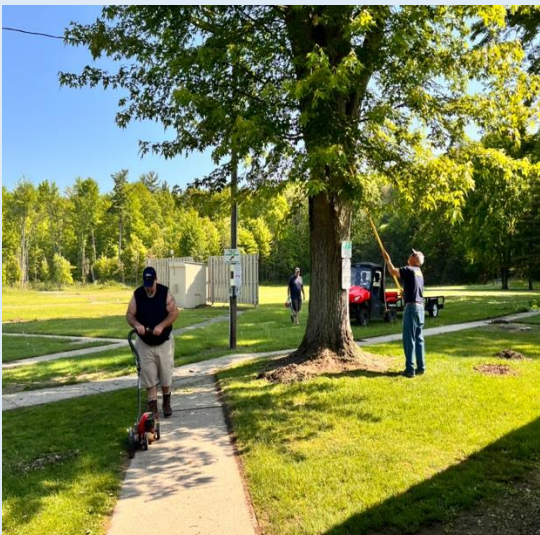
Perfect Day to be Outside