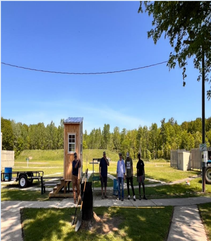
Range Clean Up Day