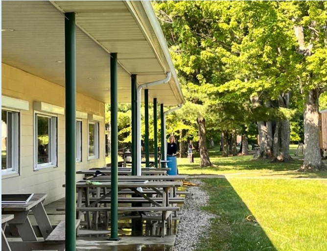
They Didn't Miss a Spot