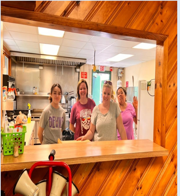
Range Clean Up Day