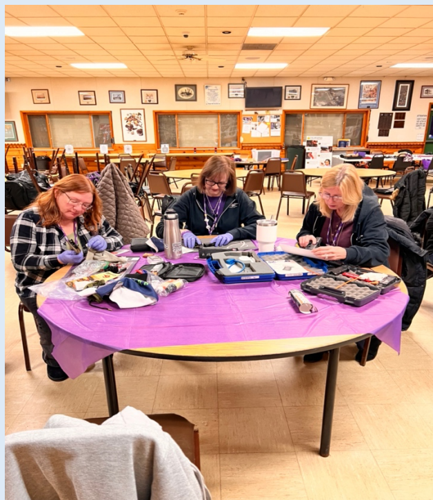
Gun Cleaning Clinic at our February Meeting

Your first meeting is complimentary! We are accepting new members.