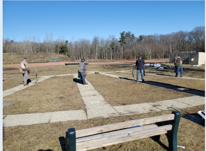
Nice sunny and clear day this time!